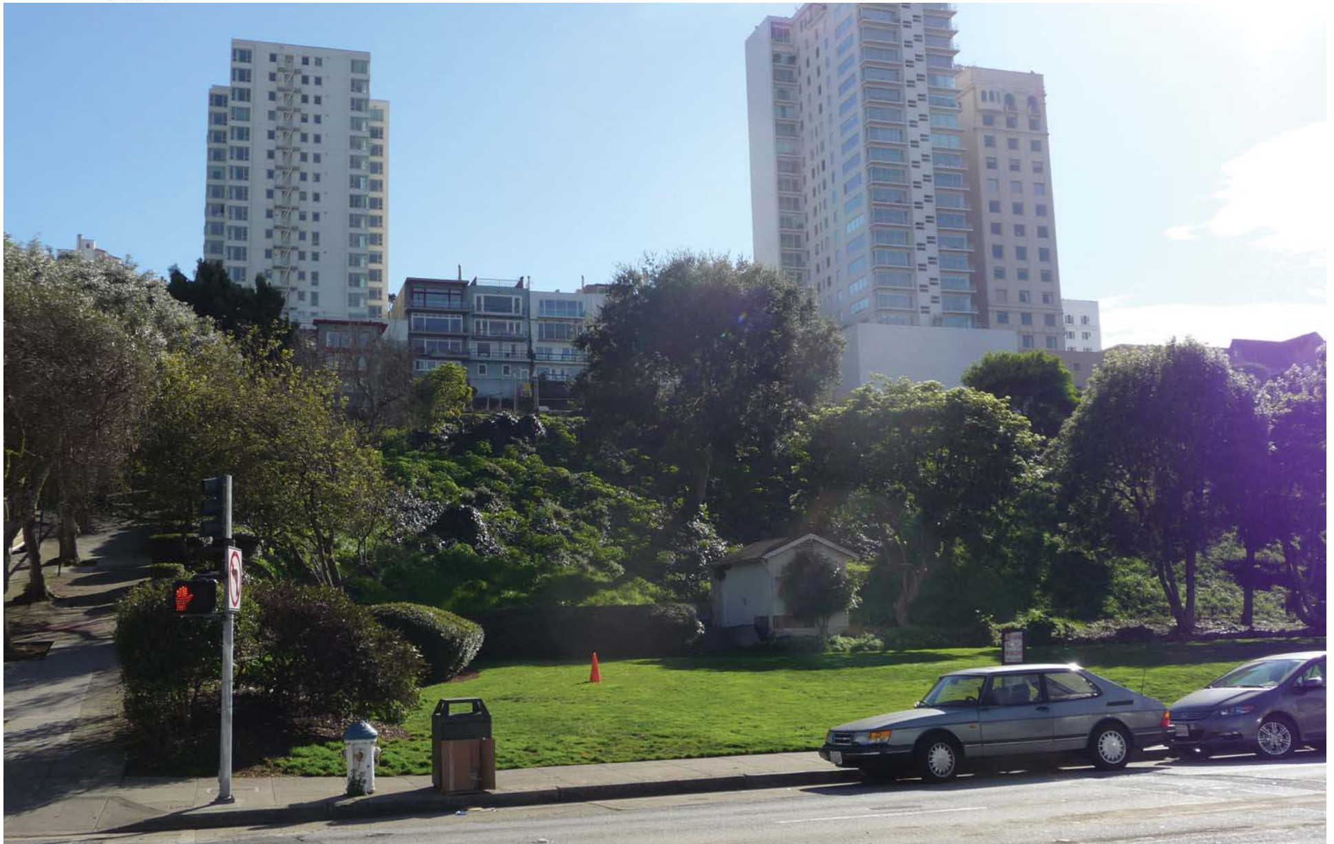
VIEW FROM HYDE AND BAY