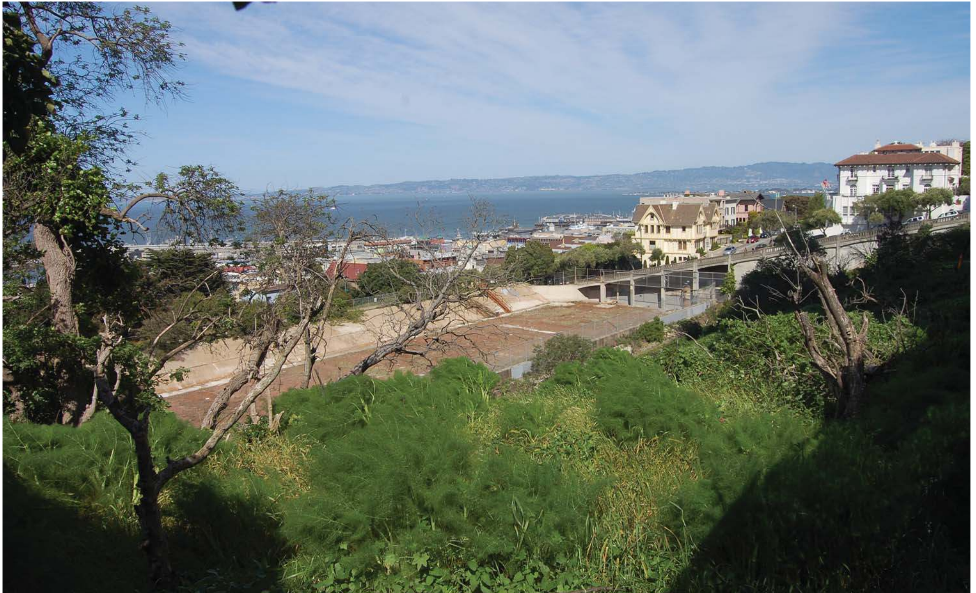
VIEW FROM LARKIN AND CHESTNUT